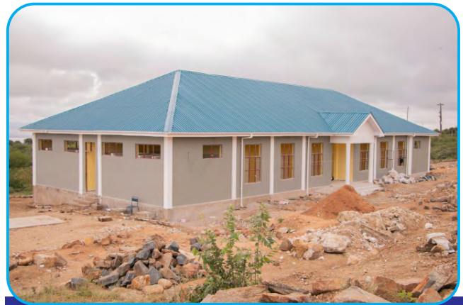
A New Kisangara Campus modern hostel under construction