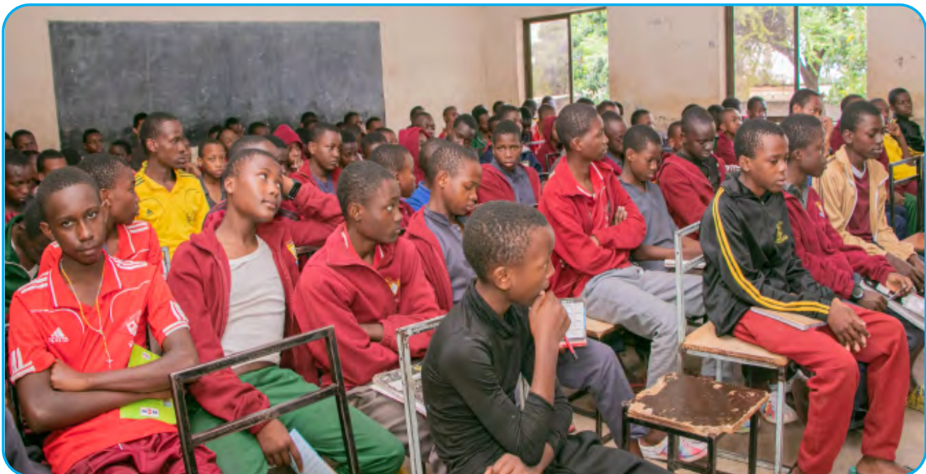
Arusha City Boys Secondary School students listening to a lecture on adolescence age.

In that short training, the students were insisted to focus on their studies when they are at school and outside the school and escape irresponsible behaviors that are against our societal and country ethics. Direct with that the students were briefed about gender-based violence and how to avoid it as well as the effects of drug abuse and alcohol.